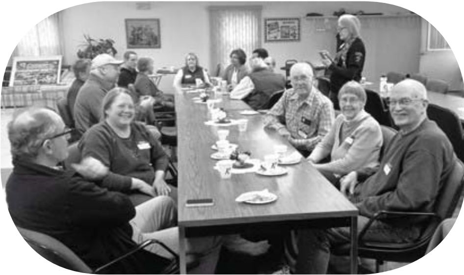
Area members and friends visiting with the board and staff after the March 14 meeting in New Town

The DRC Board of Directors want to visit with you and is having informal “Meet and Greet” with area members and potential members following Board meetings around the state.